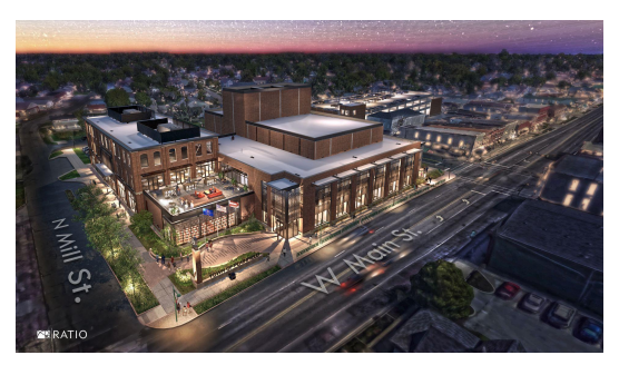
(venue rendering credit to RATIO Architects)